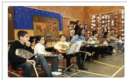
Pupils perform at a tribute event to Manos Hadjidakis

Please refer to the following website for more information on the exams: www.edexcel.com or to our own website: www.stcyprianscs.com .